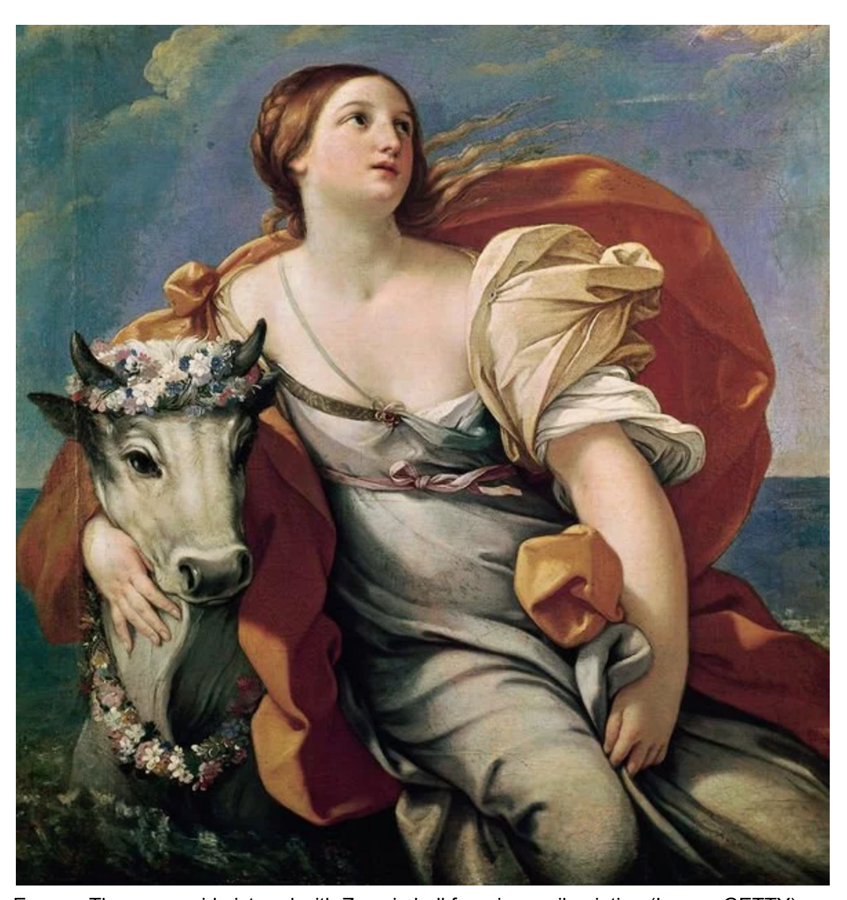
Europa: The young girl pictured with Zeus in bull form in an oil painting