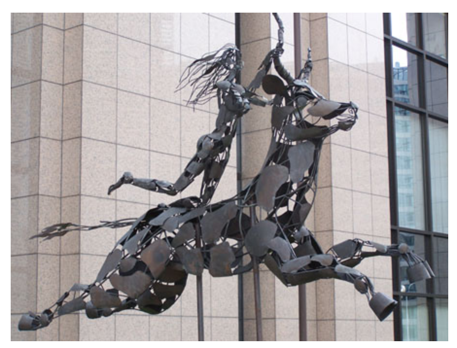
Justus Lipsius building: headquarters of the Council of the European Union - Brussels, Belgium